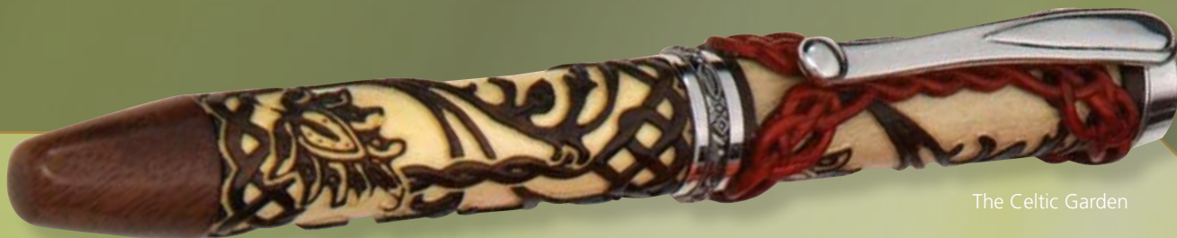
The Celtic Garden

As society shoots ever forward in the twenty-first century, many people still long for the days of yesteryear, when master craftsmen and artisans made things of beauty with their hands. During the past several years, as a result of having more leisure time and the desire to create handmade objects,