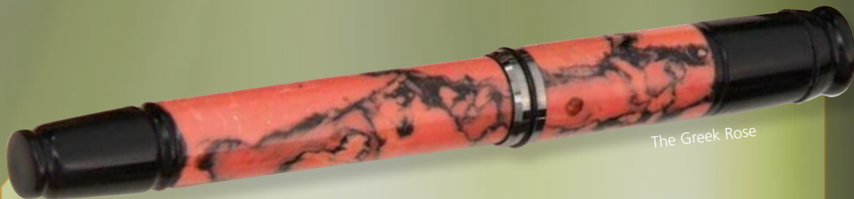
The Greek Rose

Today's artisans are learning new techniques and relearning old skills that incorporate modern technology and materials.