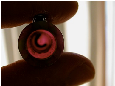
Interior view of tube with the clip inserted.

Length of upper tube is critical to ensure that the transmission will engage in the coupler/clip holder. I have had to shorten the overall length of the upper barrel to ensure the coupler fully engages the top of the transmission. Clip slot has been cut just at the top of the brass tube.