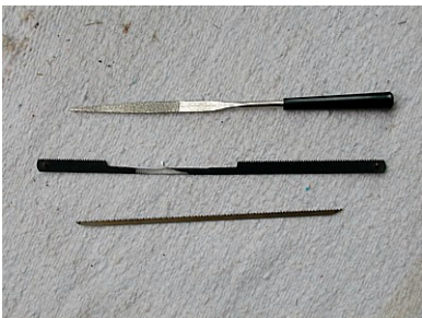
My current tools for recessing clips. Top to bottom: mini diamond file (HF), Mini hacksaw blade (ground away fore and aft, leaving one tooth to cut with), coping saw blade (ground away on ends for a small profile)