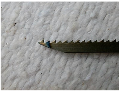
Close-up of coping saw tip