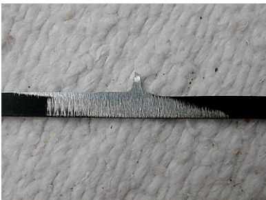
Close-up of single tooth on hacksaw blade. I started out with two teeth but took it down to just one and it seems to work better.