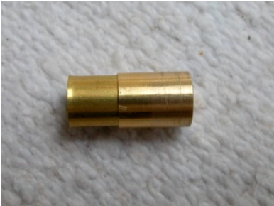
Above: Perfect fit transmission coupler/clip holder turned/sanded down to a "slip fit" so it can be pushed (not pressed) up through the tube to hold the clip in place.