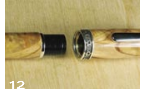
12 Assemble the cap threads.

Apply a small amount of epoxy to the inside of the cap's brass