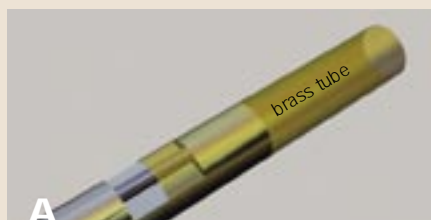
A Pin chuck