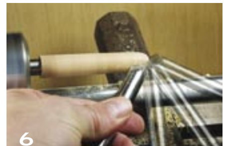
Using a diamond-point tool is an easy way to round over the end of the main body.

The simplest, most forgiving way to round the end is using a diamond-point tool. I like the ability to swing the tool through the arc without repositioning the tool rest, as shown in Photo 6 . A spindle gouge or skew also works for this cut.