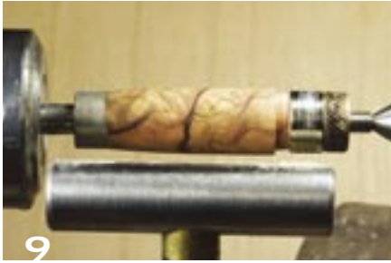
9 With a skew, turn a gentle curve.

Begin turning the barrel to match the ring diameter. Use your calipers to size the tenon for a slip-fit. Leave the tenon just a little short so you can square the cut after applying finish.