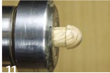
11 Chuck the tube and turn the finial to shape.

Now, switch to the Beall chuck with an appropriate collet and hold the finial reversed. Shape it, using calipers for sizing, as shown in Photo 11 . Try to match the slope of the cap tube for a continuous look, sand, and finish. End with a squaring cut at the shoulder. Then part off the ½" waste piece, leaving a ⅜" section to glue into the tube.