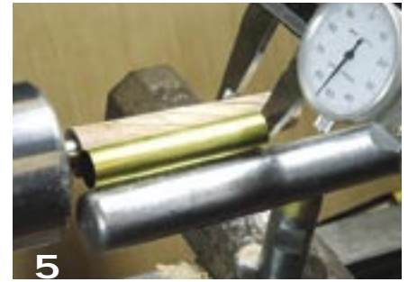
Measure the thickness at the end of the internal brass tube to avoid breaking through on the blank.

Put a spare tube lined up with the open end on the tool rest to find the end of the internal brass tube, as shown in Photo 5 . Use a skew on the final cuts to produce a surface requiring little sanding.