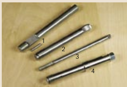
Fixtures for turning closed-end pens: pin chuck (1), home-made expansion chuck (2), tap mandrel (3), and commercial expansion chuck (4).

When you slip a brass tube over the pin and chuck, and twist the brass tube, the pin acts as a cam and locks the tube in place, as shown in Drawing A .