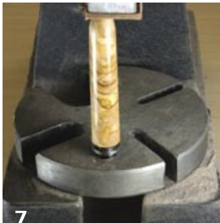
Assemble the main body using soft leather to protect the finish.

With a \frac{1}{16} " parting tool, square up the shoulder of the body that the trim ring sits against.