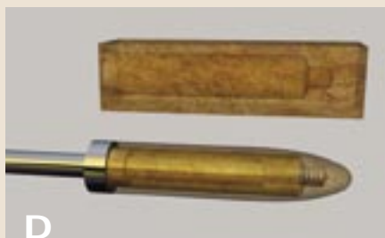
D Tap mandrel