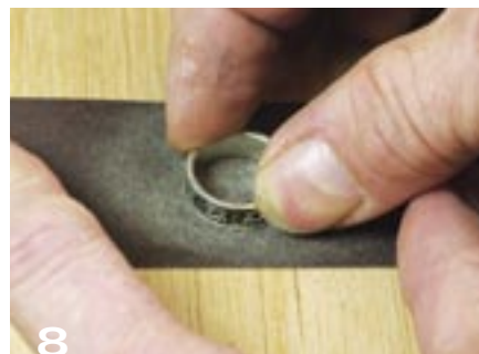
For a seamless transition, square the ring on a piece of sandpaper.

The width of the tenon accepting the ring is important. The ring should protrude beyond the wood