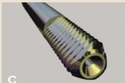
A standard pen mandrel converted into a tap mandrel